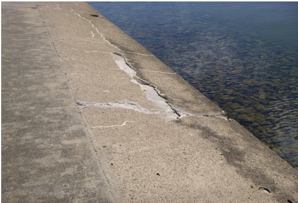
Photo 7 Dam ID# 199-0282 Chazy Lake Dam 08/15/2019 Deteriorated concrete on upstream slope of right dam