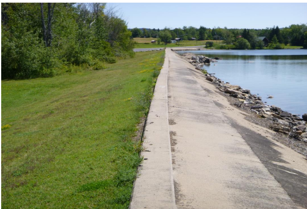
Photo 4 Dam ID# 199-0282 Chazy Lake Dam 08/15/2019 Right dam crest