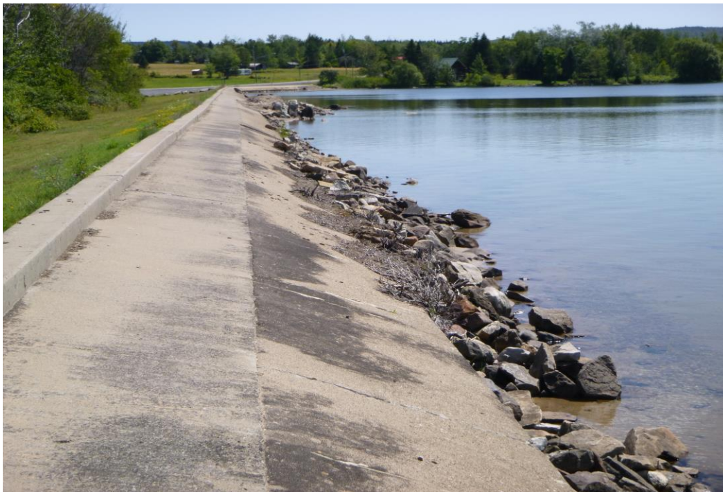
Photo 3 Dam ID# 199-0282 Chazy Lake Dam 08/15/2019 Upstream slope of right dam