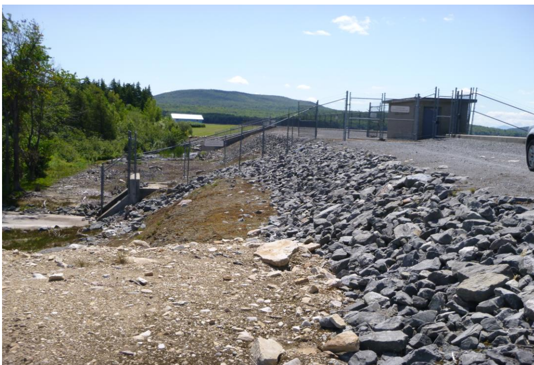
Photo 12 Dam ID# 199-0282 Chazy Lake Dam 08/15/2019 Downstream slope left dam