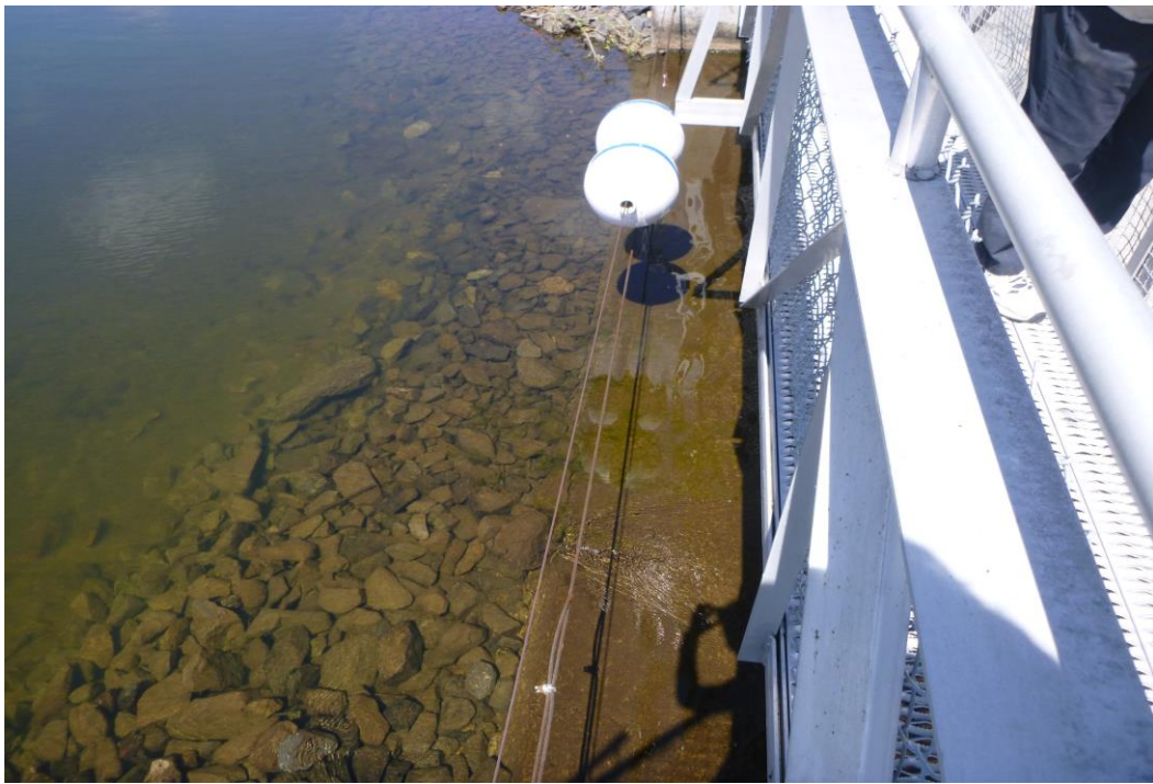
Photo 19 Dam ID# 199-0282 Chazy Lake Dam 08/15/2019 Upstream of primary spillway