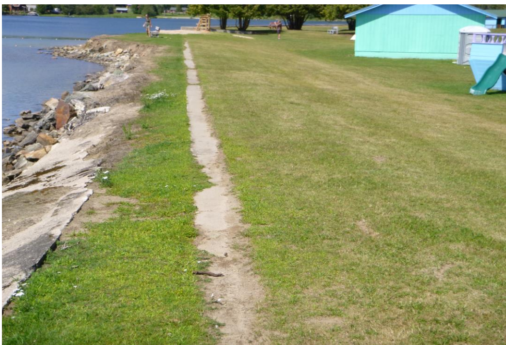
Photo 2 Dam ID# 199-0282 Chazy Lake Dam 08/15/2019 Right dam crest