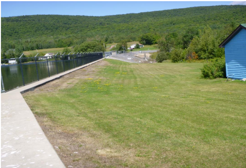
Photo 11 Dam ID# 199-0282 Chazy Lake Dam 08/15/2019 Downstream slope of mid dam