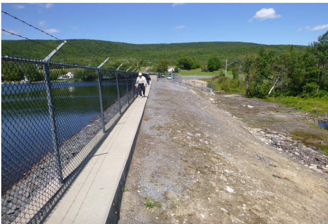
Photo 18 Dam ID# 199-0282 Chazy Lake Dam 08/15/2019 Downstream slope of left dam