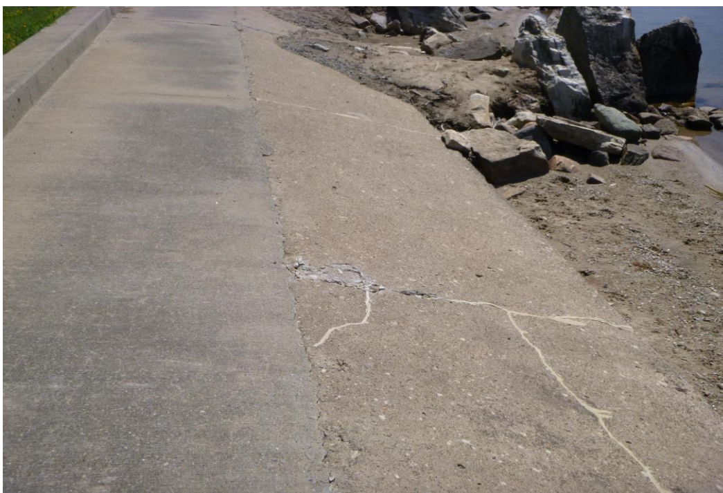
Photo 6 Dam ID# 199-0282 Chazy Lake Dam 08/15/2019 Deteriorated concrete on upstream slope of right dam