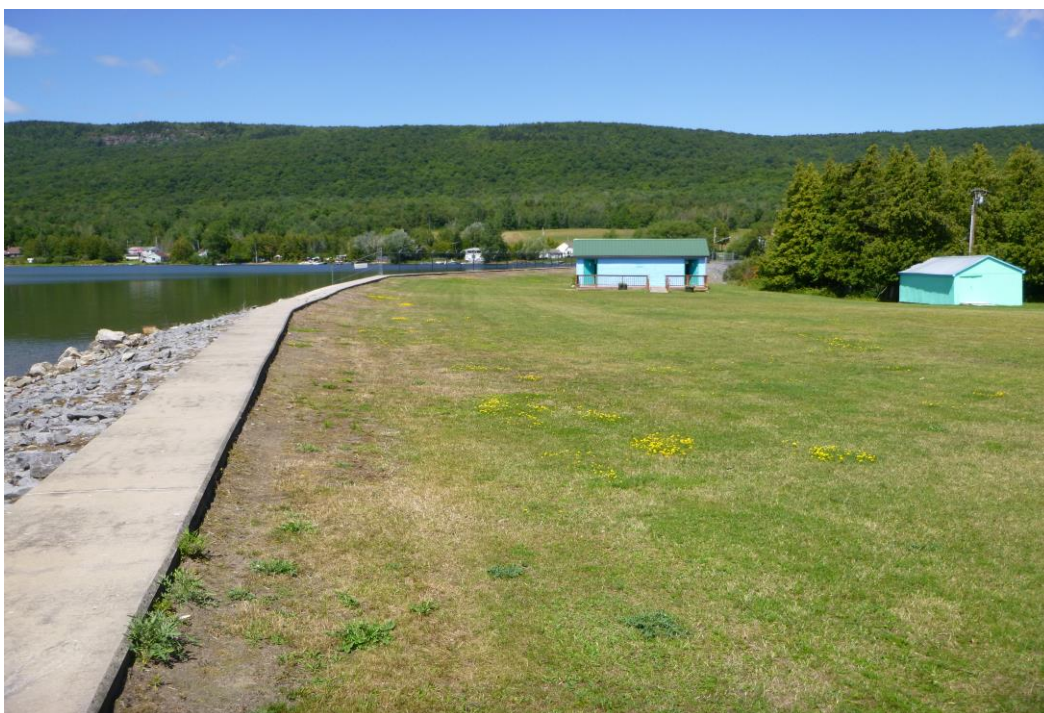
Photo 10 Dam ID# 199-0282 Chazy Lake Dam 08/15/2019 Downstream slope of mid dam