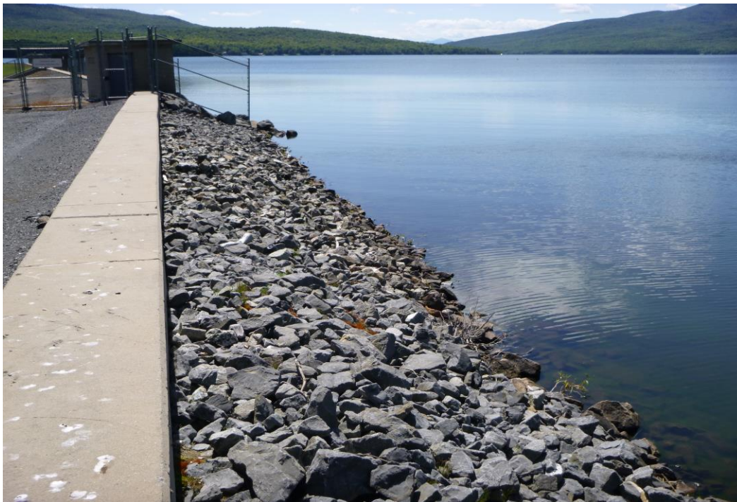
Photo 13 Dam ID# 199-0282 Chazy Lake Dam 08/15/2019 Upstream slope of left dam