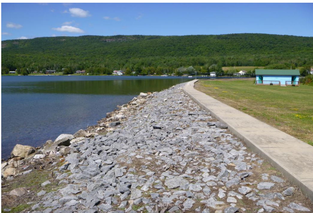
Photo 8 Dam ID# 199-0282 Chazy Lake Dam 08/15/2019 Upstream slope of mid dam