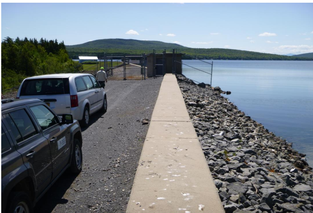
Photo 14 Dam ID# 199-0282 Chazy Lake Dam 08/15/2019 Left dam crest