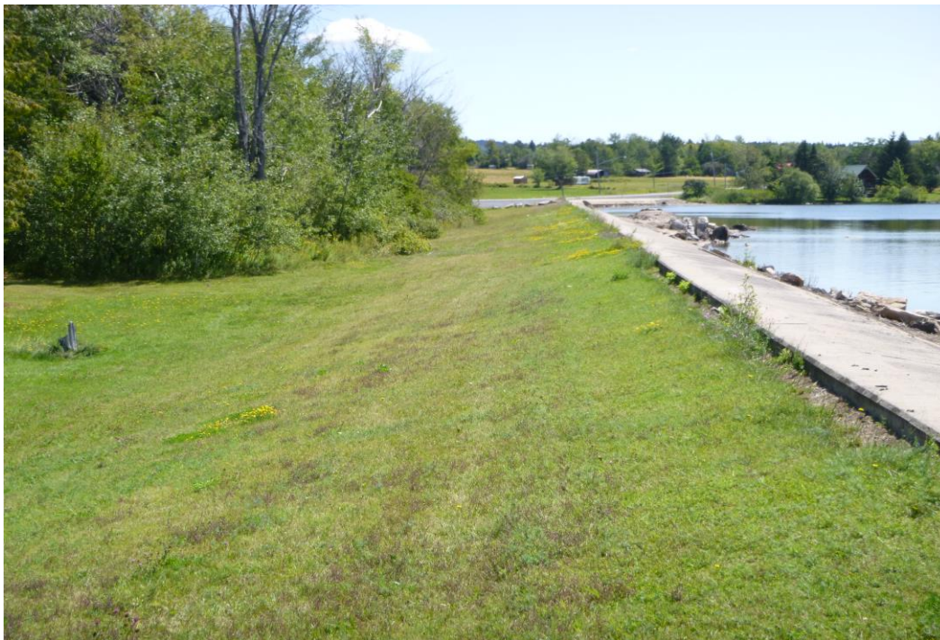
Photo 5 Dam ID# 199-0282 Chazy Lake Dam 08/15/2019 Downstream slope of right dam