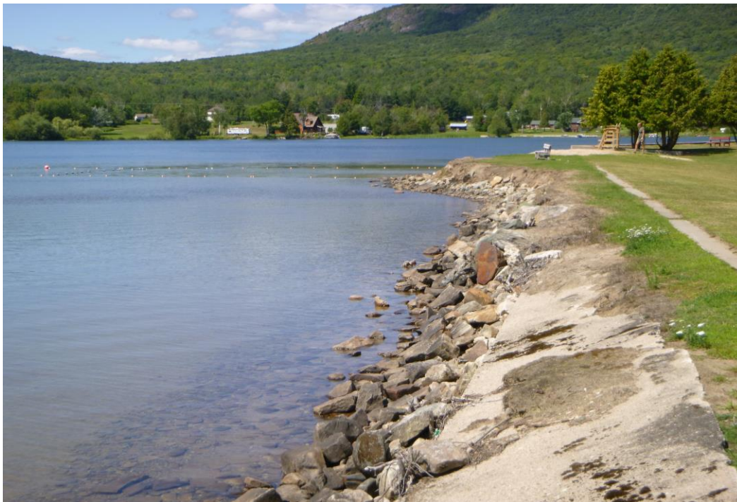
Photo 1 Dam ID# 199-0282 Chazy Lake Dam 08/15/2019 Upstream slope of right dam