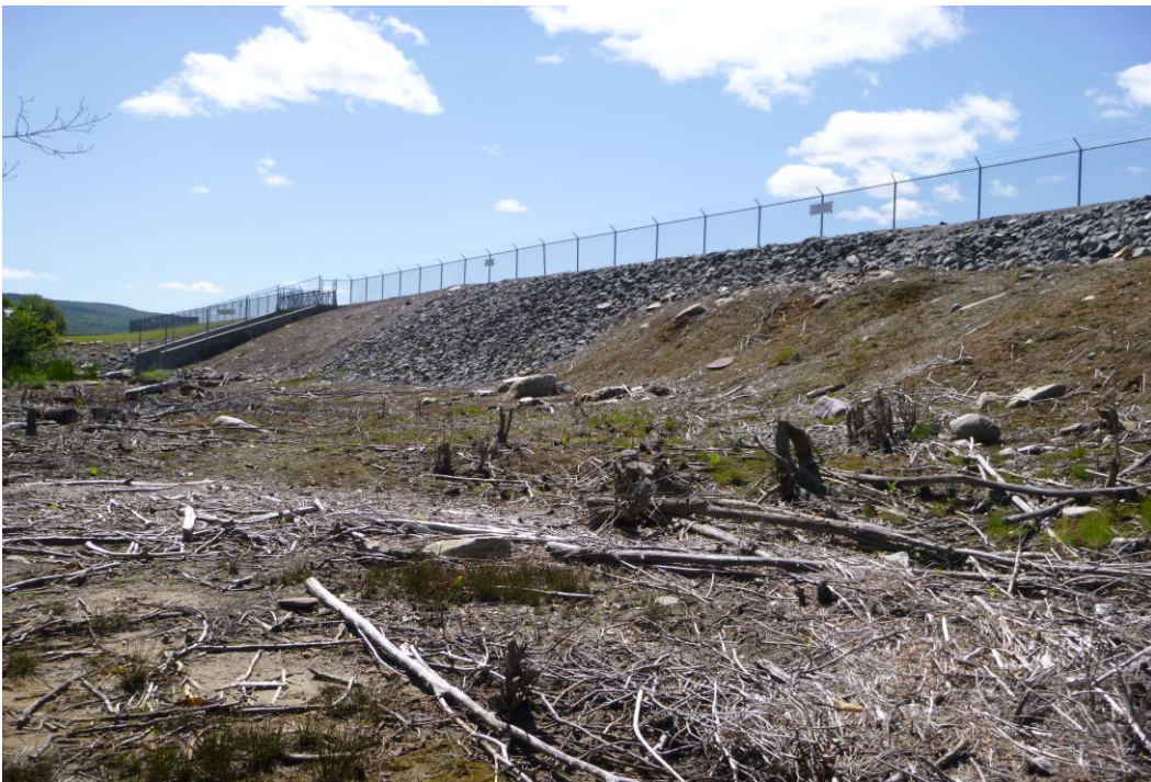
Photo 16 Dam ID# 199-0282 Chazy Lake Dam 08/15/2019 Downstream slope of left dam