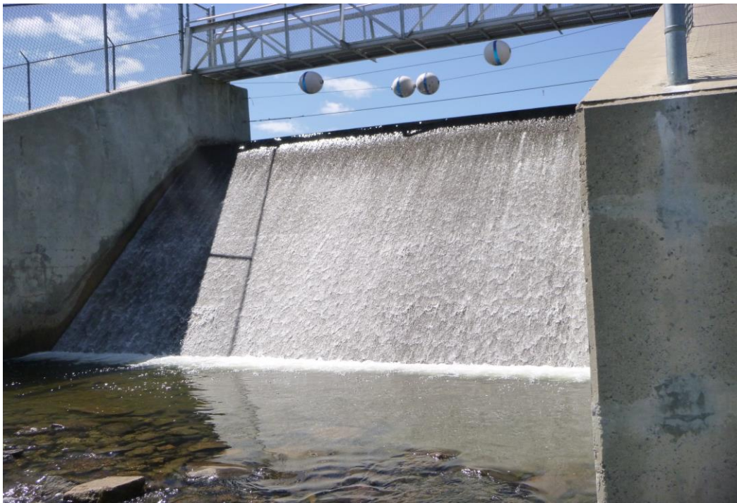
Photo 17 Dam ID# 199-0282 Chazy Lake Dam 08/15/2019 Downstream view of primary spillway