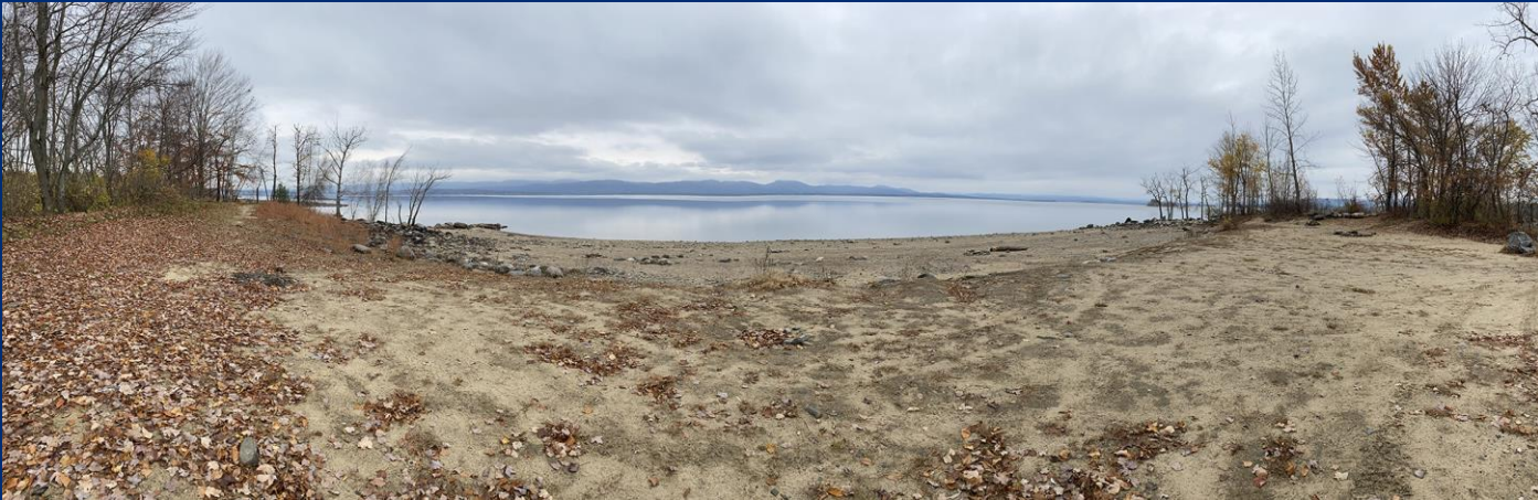
Existing beach area