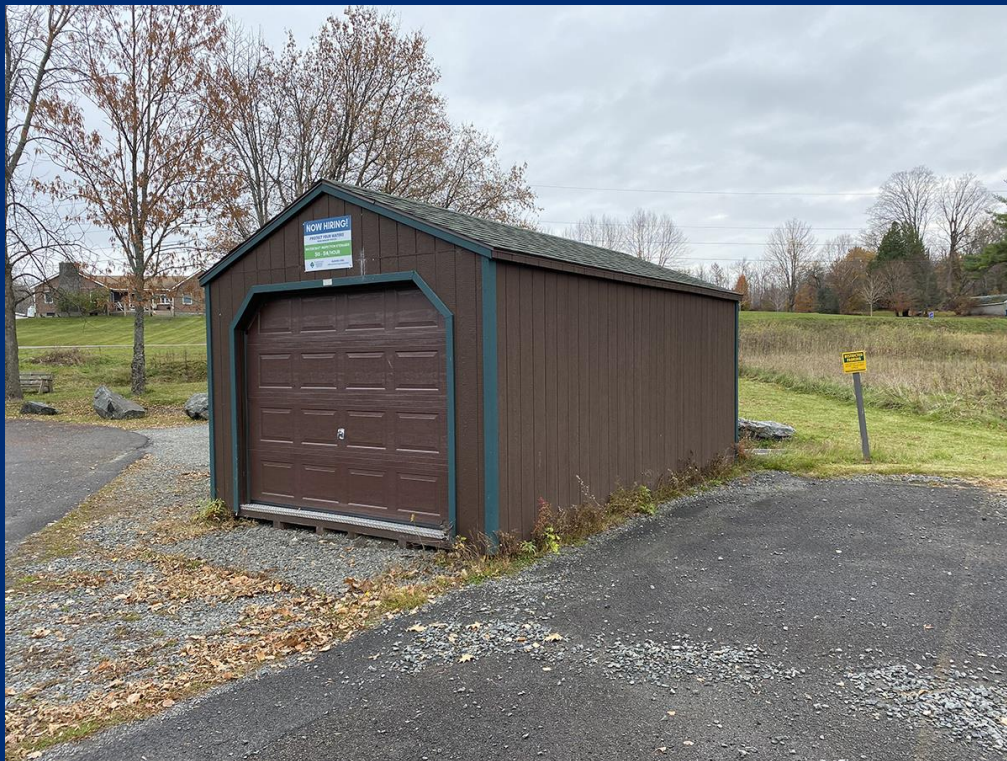
Storage shed for boat decontamination equipment