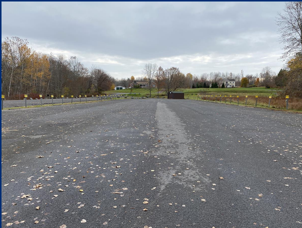
Boat launch parking area