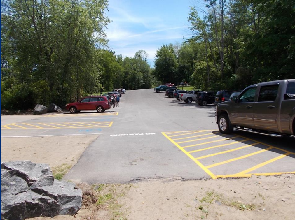
Existing parking area