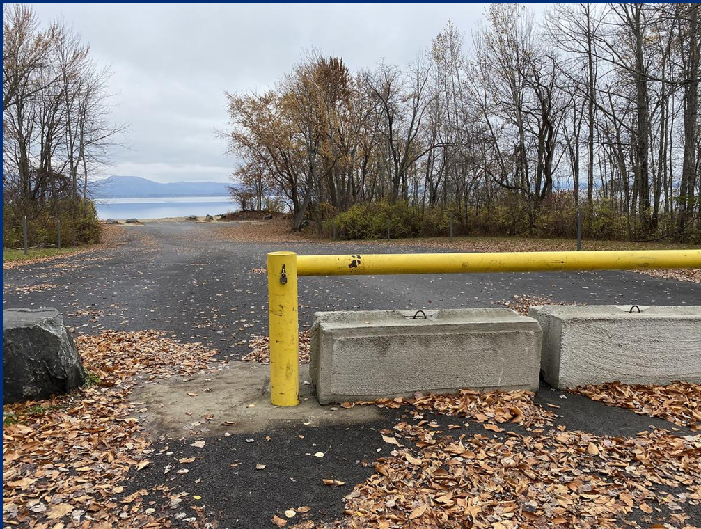
Existing parking area