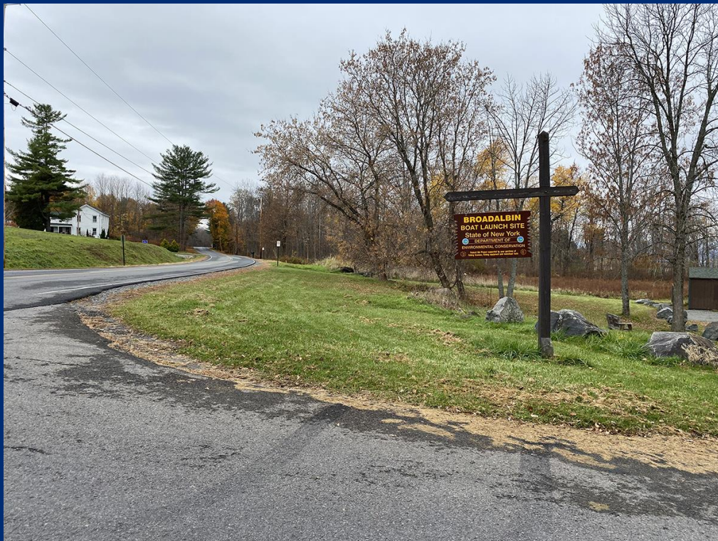
Entrance from Lakeview Road