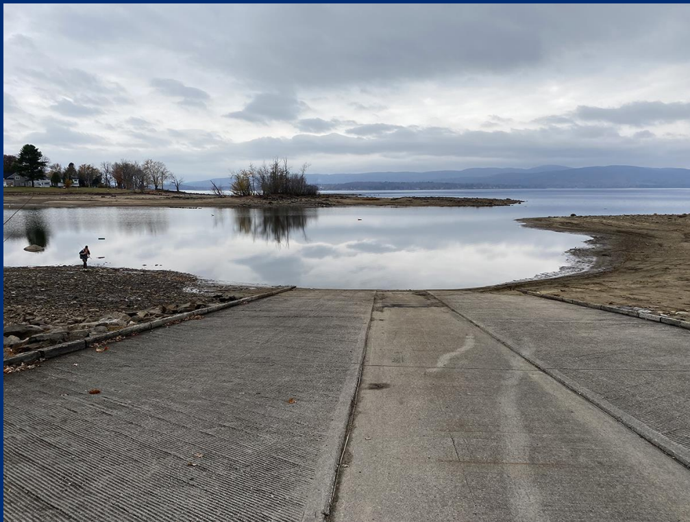
Boat launch in off-season