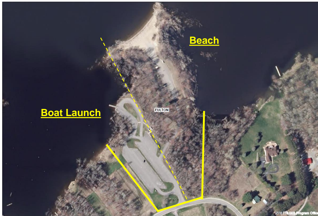
Broadalbin Boat Launch Site

Land transferred to DEC from HRBRRD in 1989