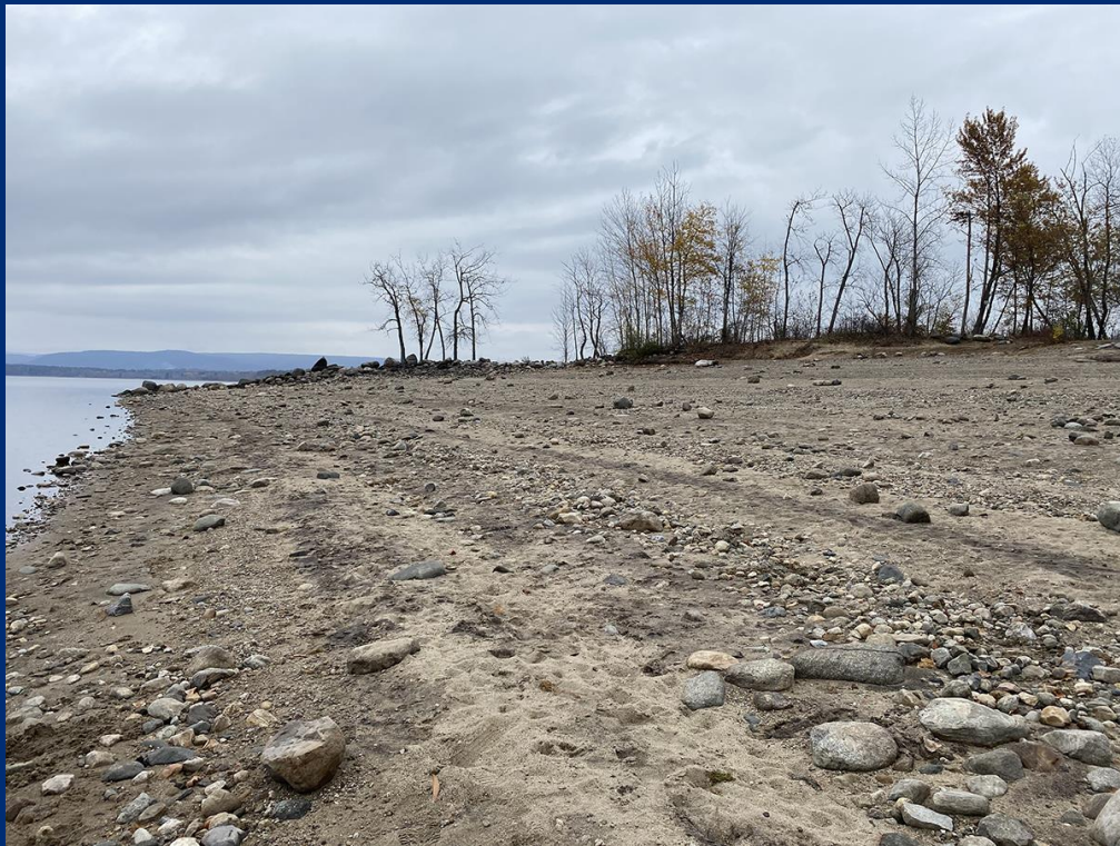
Existing beach area