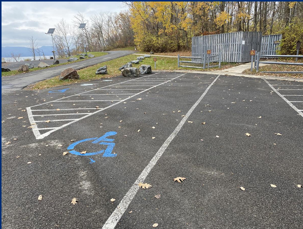
Accessible parking at boat launch