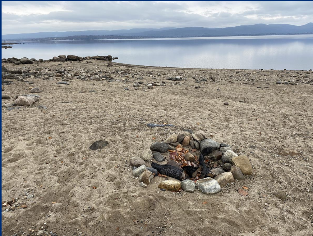
Existing beach area