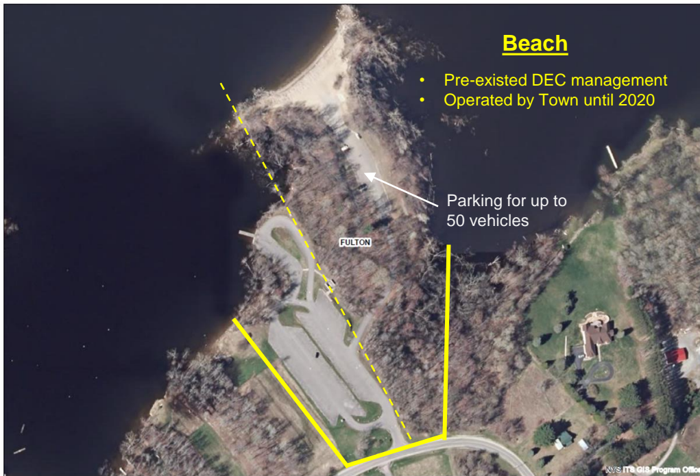
Broadalbin Boat Launch Site