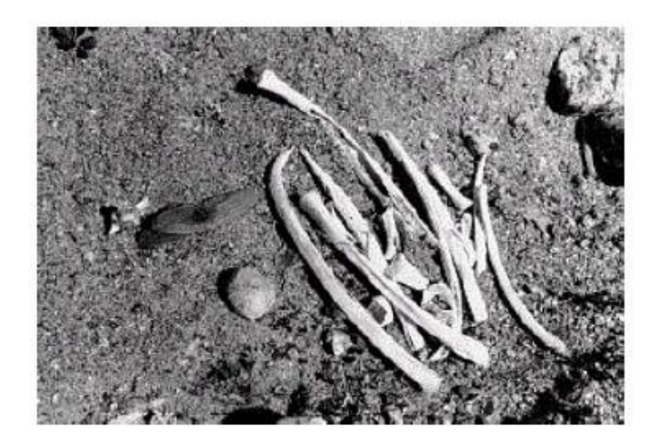
Figure 4 Skeletal remains from an Innu cemetery eroding due to flooding.