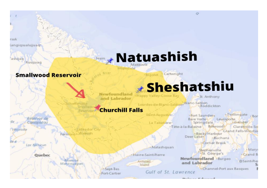
Figure 1A and 1B: Maps of the territory of the Innu of Labrador

The Innu are hunters who travelled over Nitassinan in family groups until the middle of the 20<sup>th</sup> century, using timeworn travelling routes to hunt, fish, gather and trade. Travelling was central to the Innu identity, since through travel they maintained their social and ceremonial connections with other Innu, neighbouring peoples, and the land. Innu gatherings at central locations for trade and cultural events, including near what is now the Churchill Falls Generating Station ("CF Generating Station") (marked with a red pin in Figure 1B), have been integral to the Innu way of life.