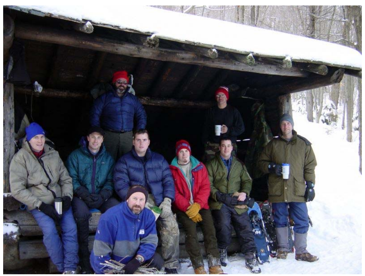
WinterCampers at the Puffer Pond Lean-to

On the other hand, lean-to's aren't particularly warm in cold weather – even if you close off the open side with a tarp as we did. They are usually situated in high-use areas. They can house rodents and the sleeping arrangements can leave you lying wide awake between two prodigious snorers.